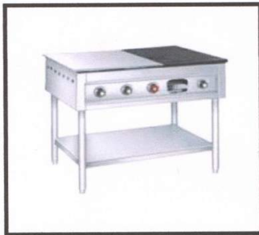
PICTORAL REPRESENTATION OF THE ROTI MAKER CUM PUFFER