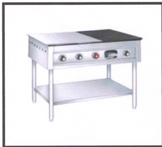
PICTORAL REPRESENTATION OF THE ROTI MAKER CUM PUFFER

Handwritten signature and date: 11/02/16